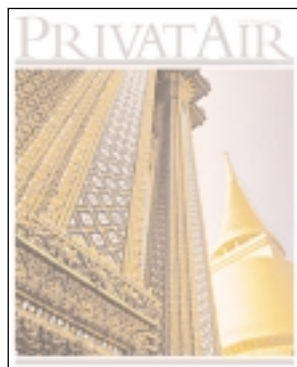
Cover: Grand Palace, Bangkok, Thailand

PrivatAir SA Chemin des Papillons 18 PO Box 572 1215 Geneva 15 Telephone +41 22 929 6700 Fax: +41 22 929 6701 E-mail: info@privatair.com www.privatair.com